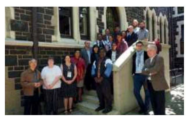
ETTC Otago participants and facilitators.

The National Commission provided funding towards the travel of Pacific delegates to the University of Otago's Ethics Teachers' Training Course from 20 to 24 November. The course was a part of UNESCO's bioethics professional capacity building programme targeting ethics teachers, and the first Ethics Teachers' Training Course (ETTC) that was held in the Pacific region.