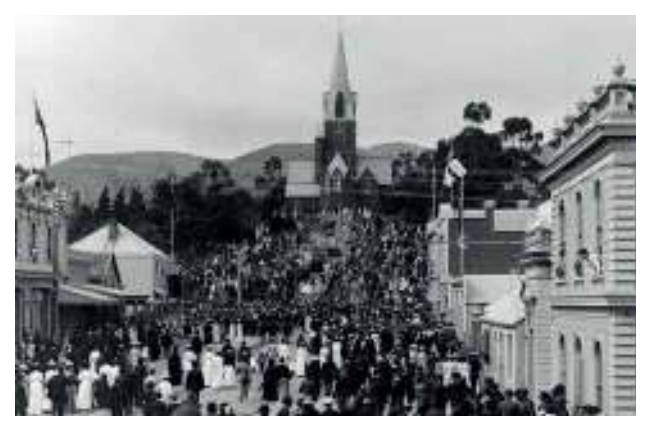
Trafalgar Street, Queen Victoria Jubilee, 1887.

A complete and comprehensive photographic legacy, spanning nearly a century of life in Nelson, Tasman and beyond. Surveying society and presenting its inhabitants, the collection constitutes an unparalleled photographic study of the development of a new nation from soon after European settlement until after World War II.