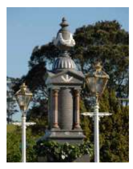
Tomb of Te Whiti-o-Rongomai at Parihaka, Taranaki.

Summary: The Parihaka Network will trial an educational resource package, including material on New Zealand history, peace, conflict resolution and volunteerism. The intent is to embed and normalise New Zealand's history of conflict, war and peacemaking into the lives of New Zealanders. This will include children celebrating heroes like Tohu and Te Whiti, learning about justice and celebrating a peace day on 5 November.