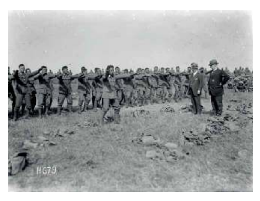
Members of the Pioneer Battalion performing a haka for ministers Massey and Ward, Bois-de-Warnimont, France. Ref: 1/2-013283-G. /records/22721971

A collection of First World War photographs by Henry Armytage Sanders and Thomas Scales. It documents activities of New Zealanders at places of significance including the Somme, Passchendaele and Le Quesnoy, as well as aspects of the soldiers' day-to-day lives in camp and hospital. It also includes scenes at convalescent camps and peace celebrations, and views of soldiers participating in sporting events and sightseeing.