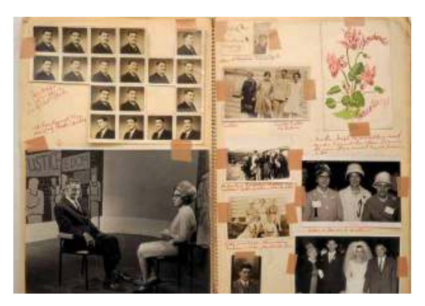
A page from one of John A. Lee's scrapbooks.

Personal papers of one-armed war hero, crowd-stirring orator, best-selling novelist, feisty politician and outspoken broadcaster John Alfred Alexander Lee (1891-1982). The papers document New Zealand social conditions in the first decades of the 20th century and the growth of a distinctively New Zealand literature in the 1930s. It also covers the inside workings of the New Zealand Labour Party, from its foundation to the formation of the First Labour Government in this period.