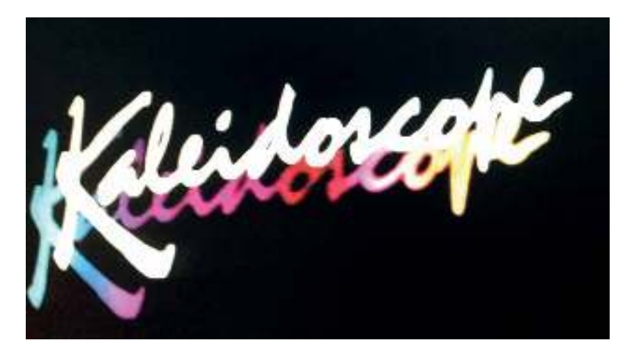
Screen grab of the Kaleidoscope opening credits circa 1986.

Produced by Television New Zealand, Kaleidoscope was an arts documentary series made for television. As the only television arts programme in New Zealand, the series documented, often in long-form interviews, a wide range of New Zealand arts and artists.