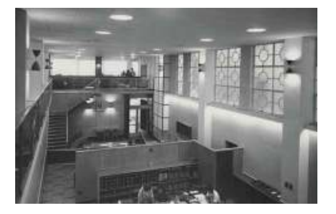
Interior of State Fire Building, Princes and Rattray Streets, Dunedin, c.1960. Salmond & Burt architects.

A record of more than a century of architectural development in New Zealand demonstrating the way New Zealanders have lived in their built environment. It includes architectural plans/drawings, building specifications, contract records, financial records, photographs, and other business records for thousands of building projects between 1862 and 2008.