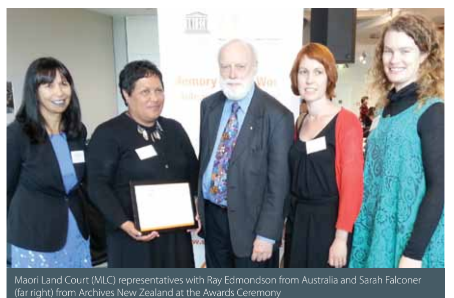
LINKS Memory of the World New Zealand: http://www.unescomow.org.nz/

Memory of the World International: http://bit.ly/MOTWorld